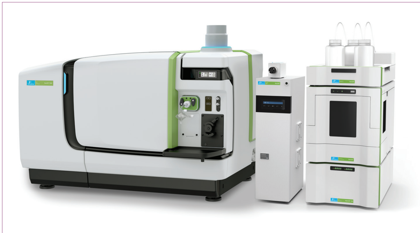
Figure 2. Recommended layout of NexSAR HPLC-ICP-MS Speciation Solution.